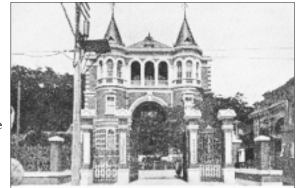
Figure 5. The Japanese Chamber of Commerce in Busan (built in 1904)

Educational institutes in Busan, including Busan Public Primary School, were in the residential areas near Seo-jeong and neighboring districts. Also, in Choryang, there was the Choryang Primary School. 27