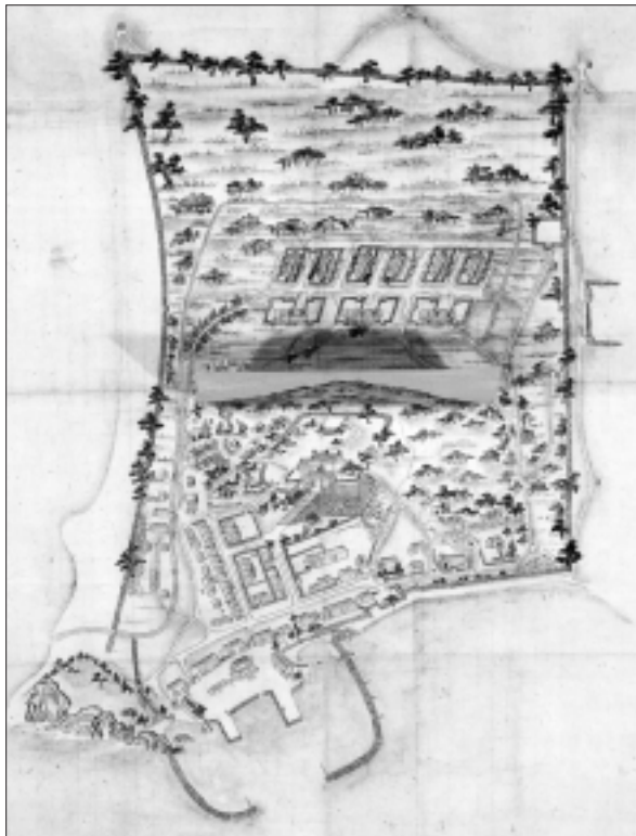
Figure 1. Map of the Choryang Waegwan before the Opening of Ports

1876, when negotiations for the establishment of a Japanese concession in Korea were underway, a post office was established within the Japanese diplomatic compound in Busan. In January 1878, a branch of the First National Bank of Japan was opened in Busan with the approval of the Joseon government. In October 1879, a Japanese consulate was set up at the site where the chief of the Japanese settlement stayed during the Choryang Waegwan period. During the same period, police stations, banks, and big stores were constructed around the Japanese consulate, and the area around Donggwan 4