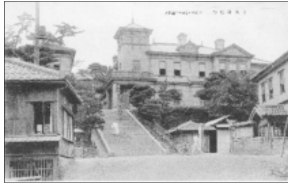
Figure 4. Japanese Consulate (built in 1904)