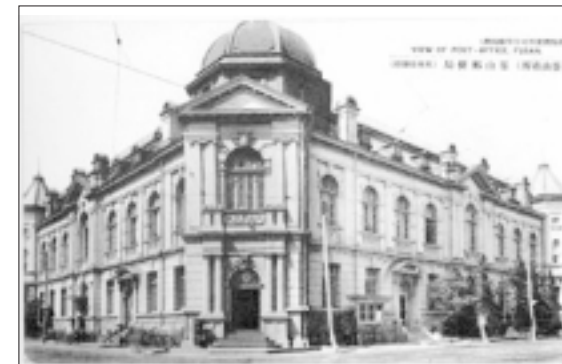
Figure 6. Busan Post Office (built in March 1910)